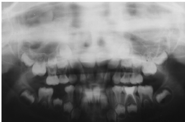
Fig. 2: Orthopantomogram

It has been suggested that single pyramid shaped roots in molars can be inherited as an autosomal dominant condition. 11 However, another report on single rooted molars in the primary and permanent dentition in two siblings, suggested an autosomal recessive inheritance pattern. 12