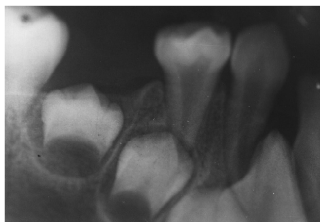
Fig. 1B: Mandibular right primary first molar